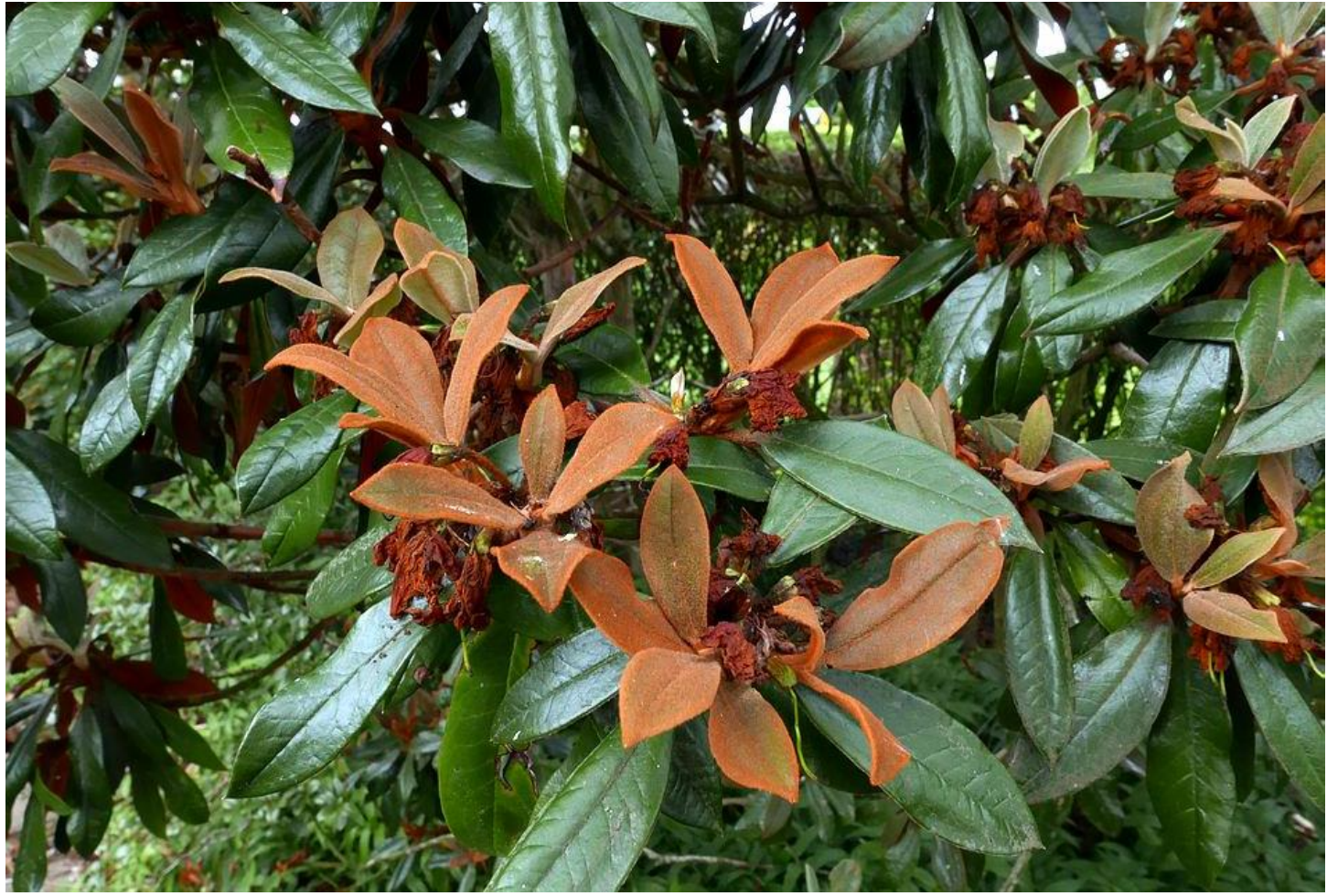
The shoots Rhododendron bureavii with very small new leaves are holding on to the dried out remains of the flowers – it is possible that the leaves will continue to grow if the cooler wetter conditions return before the frosts.