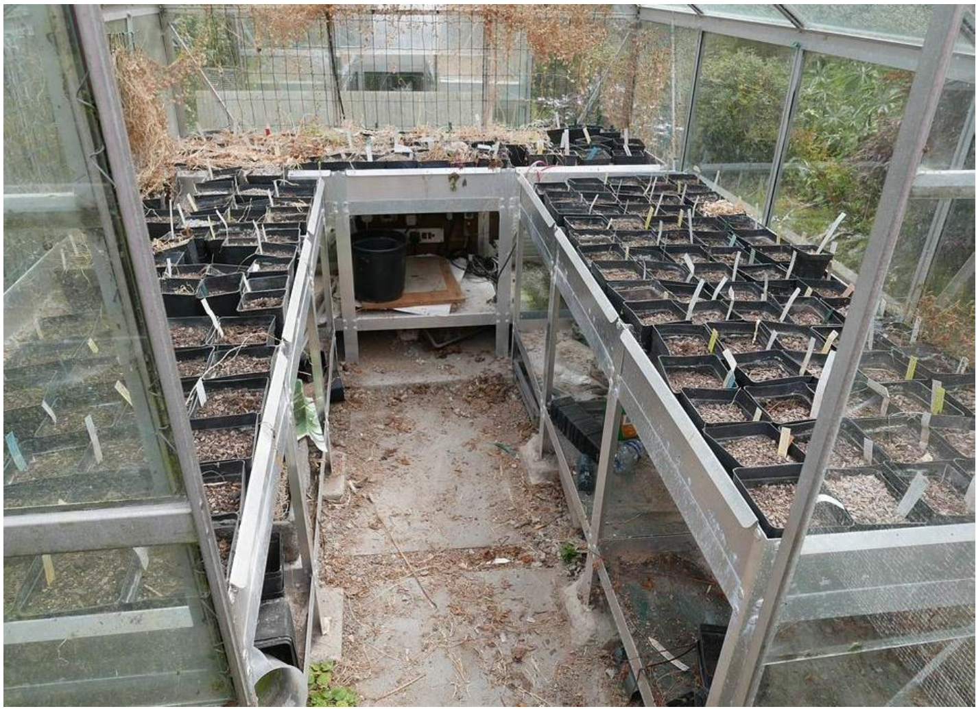
I am also working my way through repotting the bulbs in the bulb houses where I am finding mixed results.

Every year brings different challenges: some, such as watering and feeding, we have control over, others are dependent on the prevailing weather and the tolerance of the bulbs. For a combination of these variables this has not been the best year for some of our bulbs. This pot of Narcissus bulbocodium has done well where a reasonable growth and rate of increase has allowed me to fill the pot and have some left over for planting out in a raised bed.