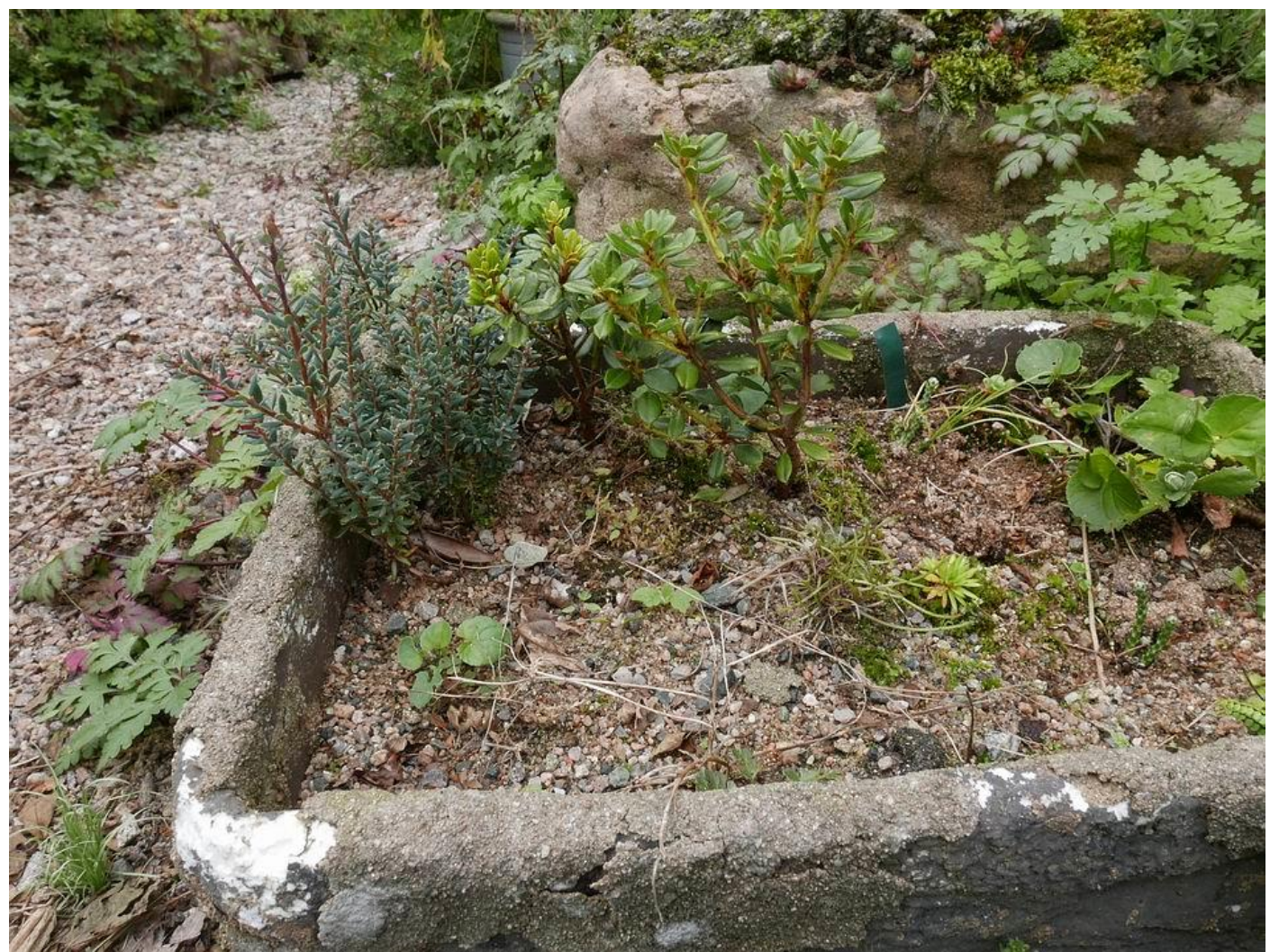
Cuttings growing in box of sand.