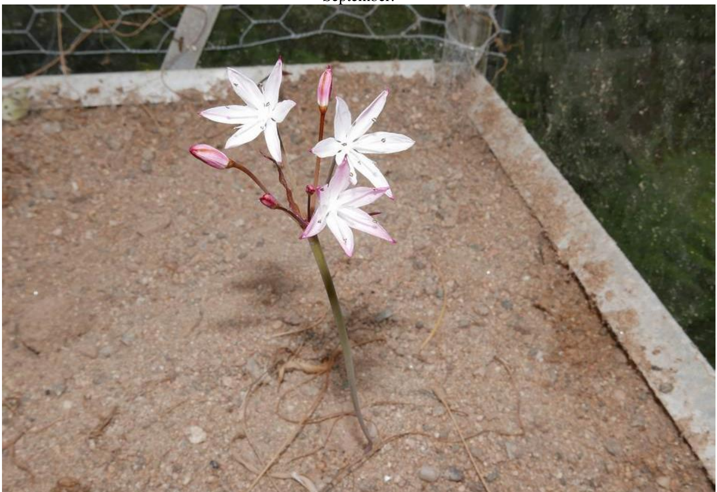
Recently we acquired some South African bulbs including Strumaria karooica to try in the sand and I am delighted to see that it is flowering now extending our period of flowering interest in these beds.