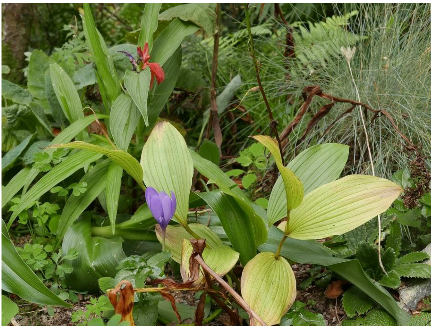
While many would think of autumn as the end of a growing year I see it as the start of the bulb growing year : as I am preparing to apply the first watering to the bulb houses, the first of the Crocus nudiflorus flowers opens.