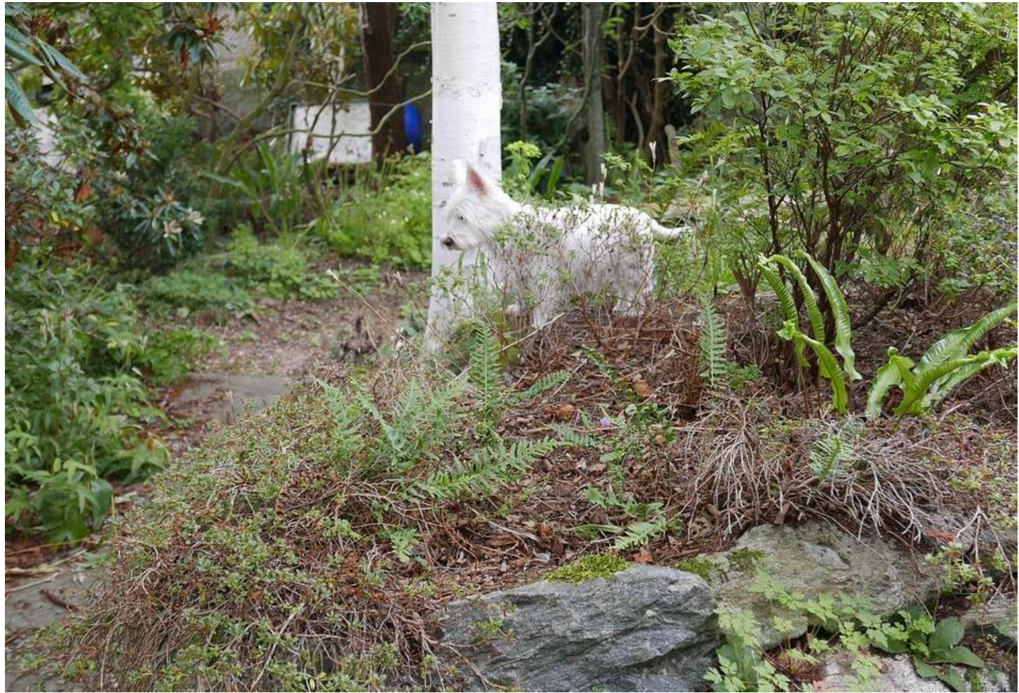
Seeing Molly on top of this central raised bed draws my attention to another couple of Rhododendron calostrotum subsp. keleticum plants that need some of areas of die back to be cut out.