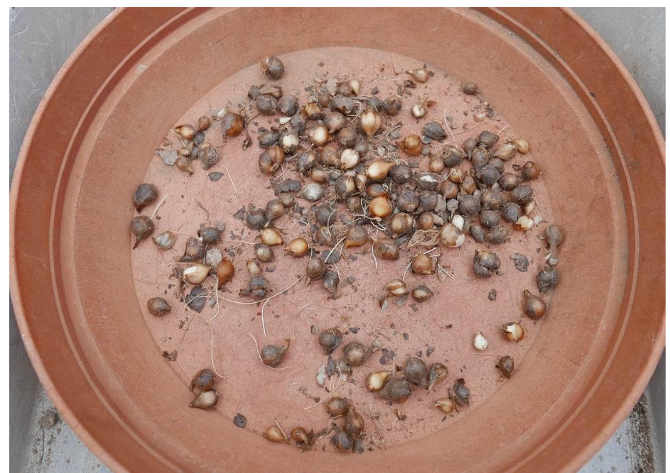
These Narcissus romieuxii bulbs have also done reasonably well but the growth of the bulbs is not as good as I would expect.