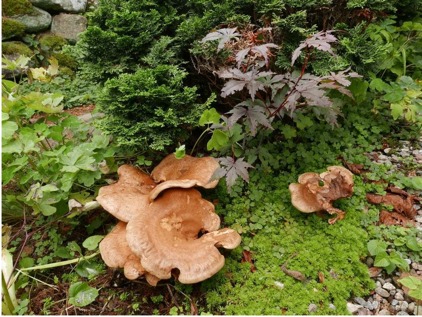
Fungi are appearing here beside a self-sown Acer seedling.