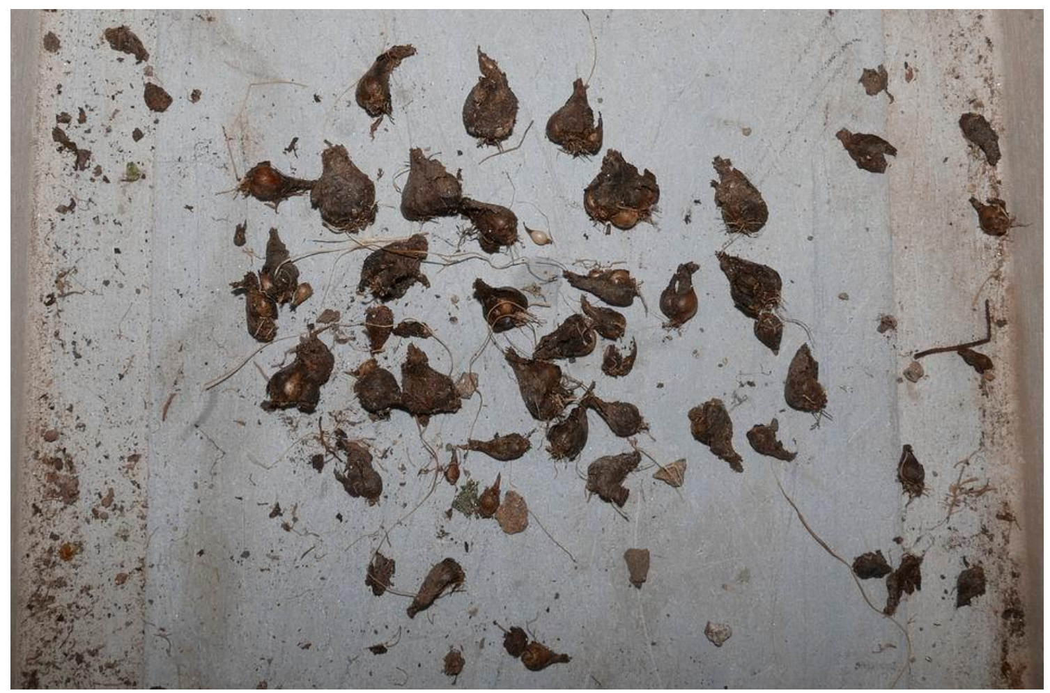
The next pot, also Narcissus romieuxii, is a disappointment with the bulbs having broken down into many small bulbs sitting within the dried out remains of last year's tunic.