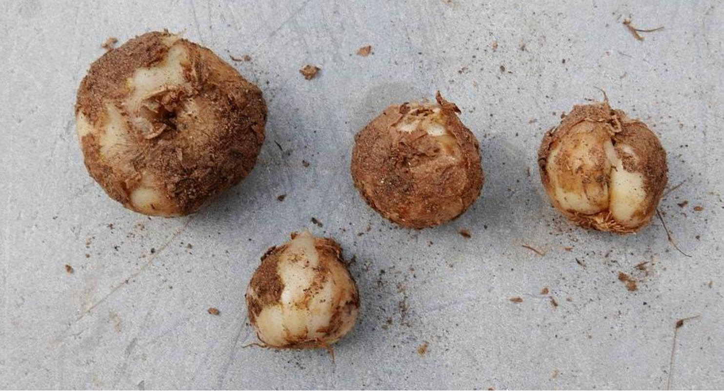
Fritillaria reuterii bulbs The Fritillaria bulbs I have repotted have mostly grown well this year.