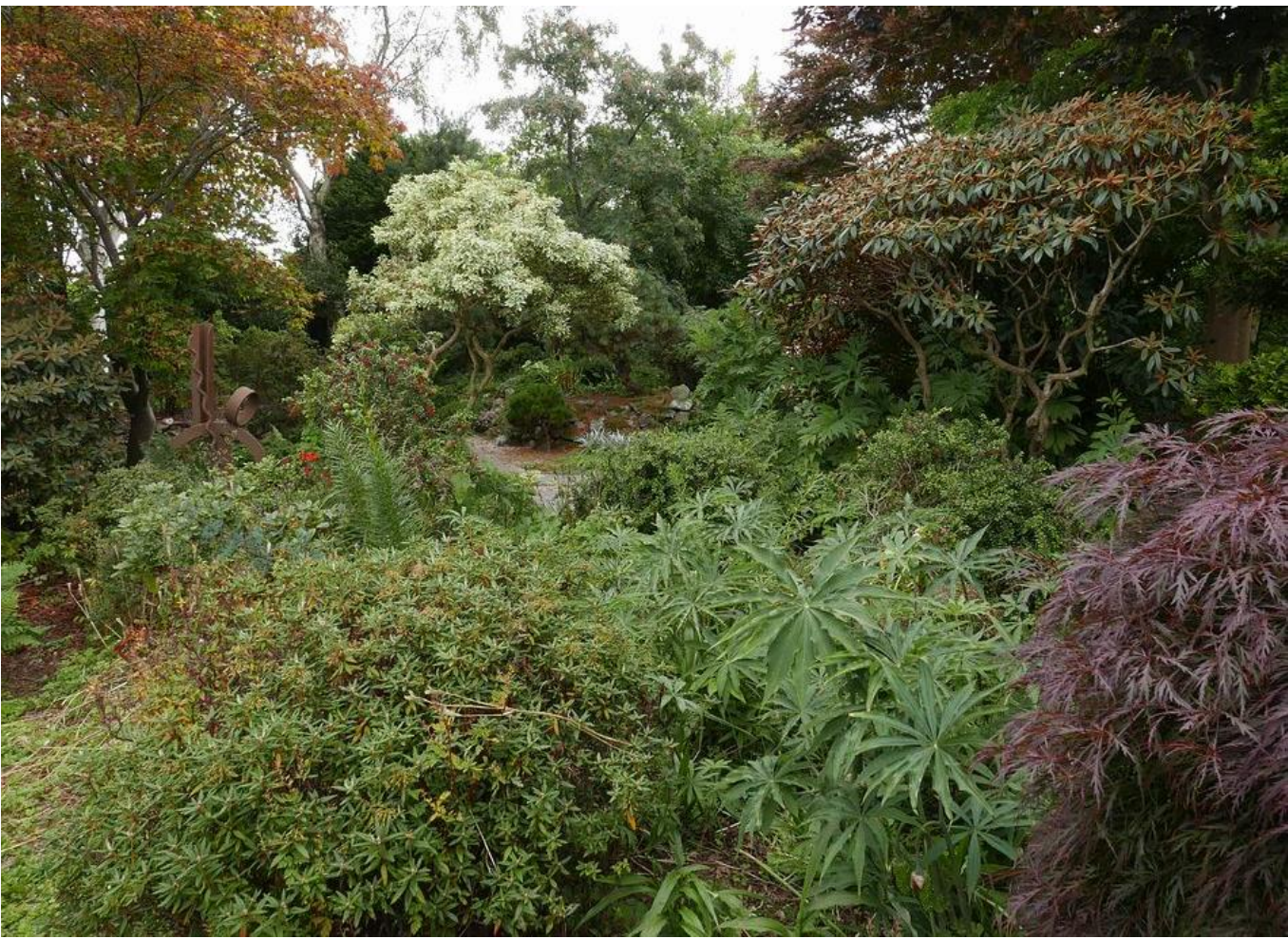
There is a distinct autumnal feeling coming to the garden now.