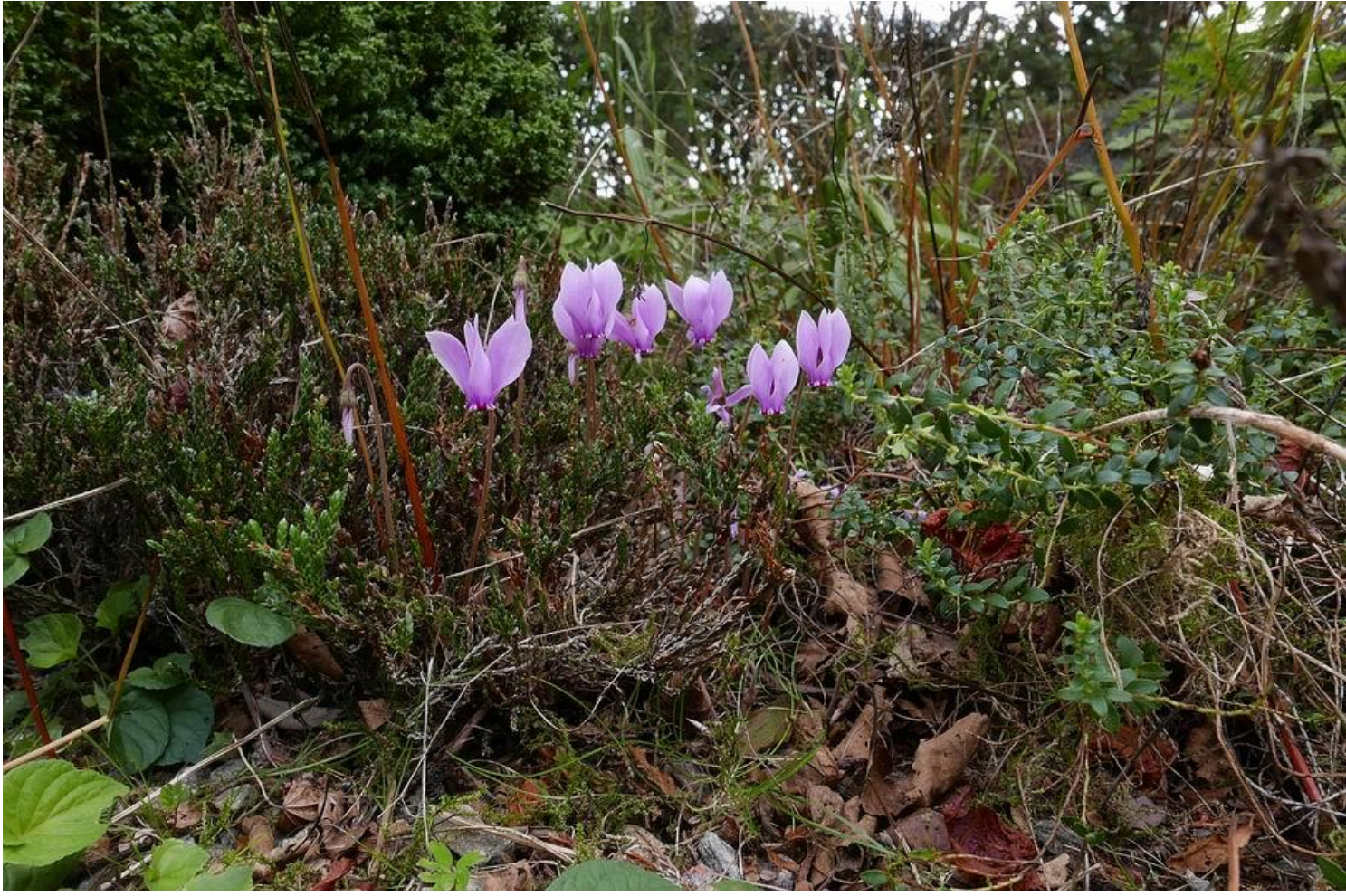
Different colour forms of Cyclamen hederifolium are appearing in a wide range of habitats.