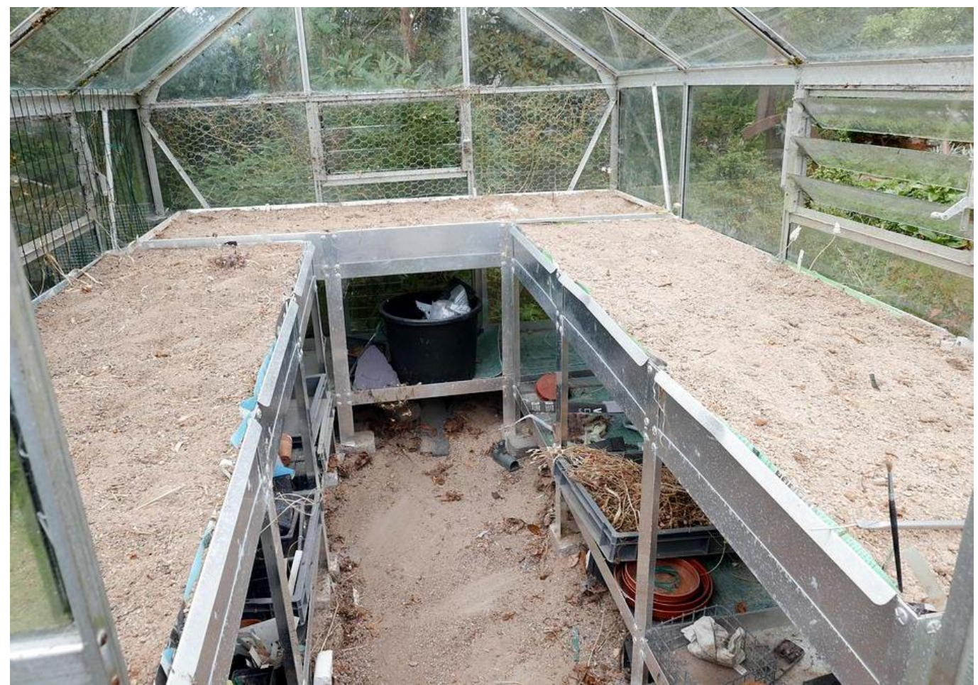
The former Fritillaria house is now entirely used for mixed bulbs planted directly in sand beds and all I had to do this summer was to remove the dried out plant debris in preparation for the first storm which I will apply in September.